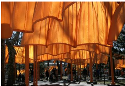
Christo & Jean-Claude, The Gates, Central Park, NYC