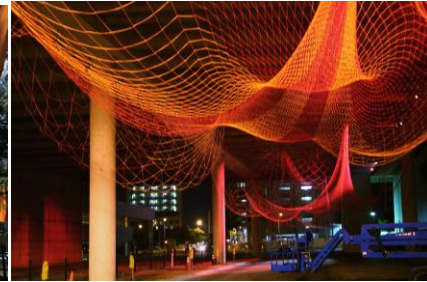
Janet Echelman, Line Drawing, Tampa, FL

Concept Determinant 2. “Become the Central Gathering Place for the Region.” Public art within the Pavilion could be designed to enhance the existing monumental scale and could define the Pavilion as a special place for community. Public art could also address acoustical design considerations.