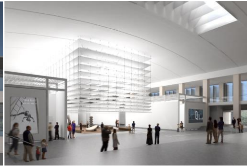
Grimshaw Architects, Queens Museum, Queens, NYC