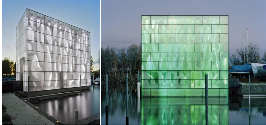
Baumschlager Eberle, Nordwesthaus Fussach, Austria

Concept Determinant 1. “Become a Lantern for the Community.” Combining art with lighting could create a stronger architectural expression for the Pavilion.